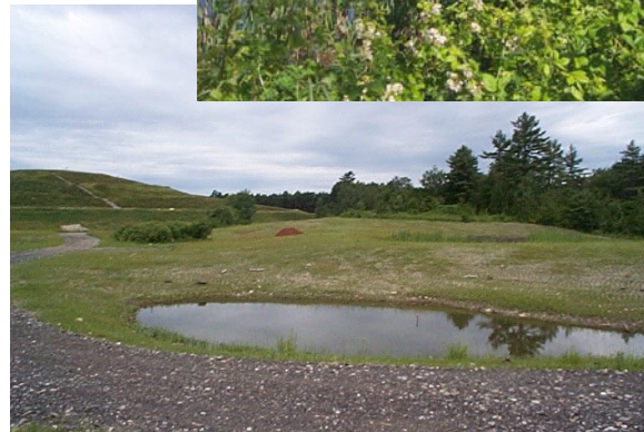
Top: Nesting box in the newly-created wetlands Bottom: The wetlands under construction

Following the listing of the site on the NPL, EPA performed groundwater studies from 1992 to 1994. The following year, the city of Saco agreed to conduct a comprehensive study of the site -- called a Remedial