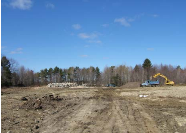
Second area of playing fields under construction

Multiple-use fields will be located on former Landfill Area 1. These fields will utilize self-standing goal posts to accommodate flexible use and eliminate the need to install the posts into the landfill cap. These fields have already been graded and vegetated; however, the city will be re-seeding the area with grass more suitable for playing fields. The city expects these fields to be ready in the spring of 2007.