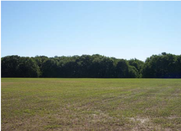
Future playing fields in Reuse Area A

In the spring of 1998, the city of Saco established a Recreation Advisory Committee made up of 11 residents to prepare recommendations for the reuse of the 168-acre property (property). The Committee's Recreation and Reuse Plan , produced in December of that year, describes a comprehensive vision that incorporates active and passive recreational uses and nature conservation areas. The city has since made some revisions to the original reuse plan.