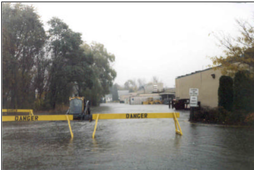
Urban flooding prior to the Sawyer Brook project.