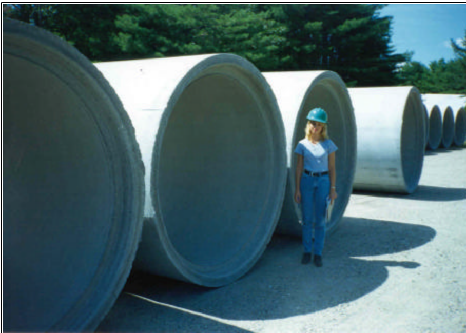
Spring Street trunk drain piping