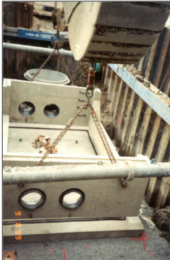
Sewer diversion structure to permit Sawyer Brook Relief Drain Construction.

The City has benefited from 404 funds for structural improvements and continues to invest local dollars to complement and supplement the Project Impact goals. These include significant funds and appropriations for the long term CSO abatement plan. The progress on CSO abatement is reported in a separate annual report.