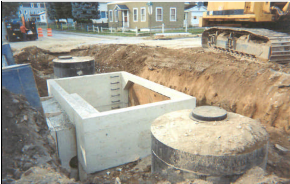
A 10-foot by 16-foot precast concrete structure was installed for the Sawyer Brook project to accommodate the trunk line transition from a box culvert to twin circular storm drain lines.