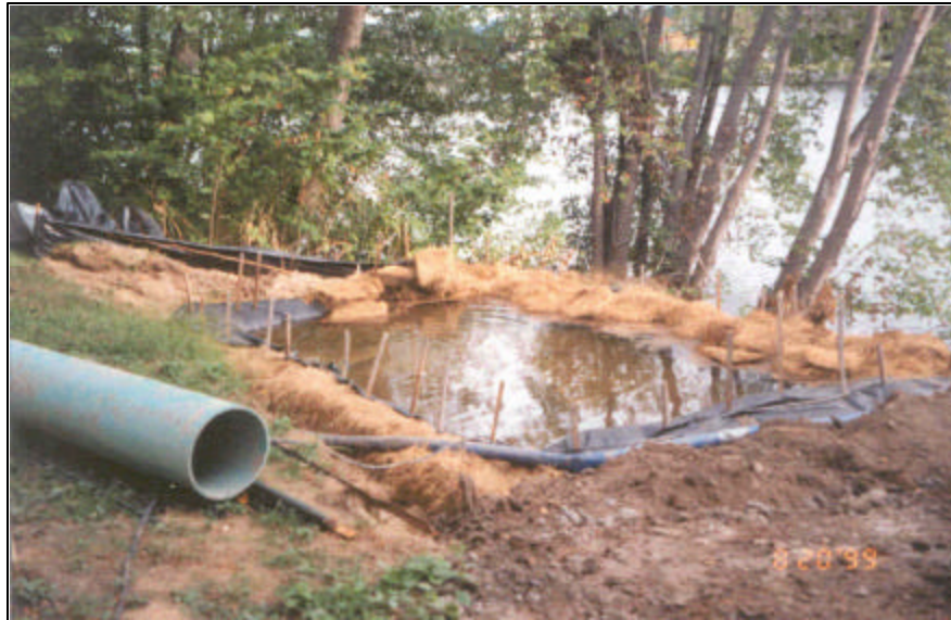
A temporary sedimentation basin, silt fence and hay bales were utilized at the area of the trunk outfall to protect the Saco River from suspended solids and erosion (Spring Street Trunk Storm Drain Project).

loss of flood storage. Combined sewer overflows result from intense stormwater flows in approximately 123 acres of the City. Major watercourses subject to localized flooding include Bear Brook, the Hill Street watershed, Sawyer Brook, and others. Flooding from localized events generally has a duration of several hours. The spring when snow melt occurs and fall coastal storms are the more likely conditions for flooding in the larger inter-city waterways, but unexpected heavy thunderstorms can cause very localized flooding events in smaller watersheds.