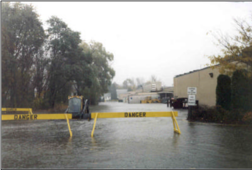
Urban flooding prior to the Sawyer Brook project.

The City has benefited from 404 funds for structural improvements and continues to invest local dollars to complement and supplement the Project Impact goals. These include significant funds and