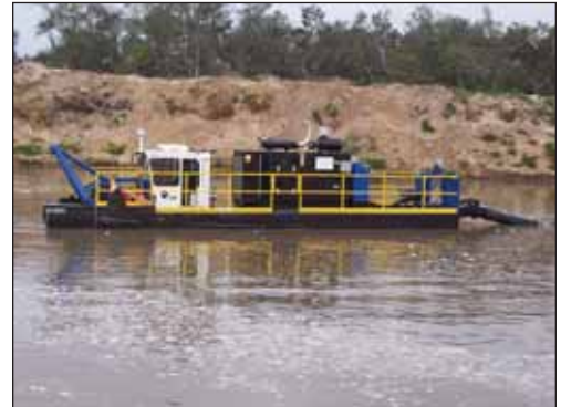
A Model 7012 HP removes sand from a sand mine in Eastern Florida.