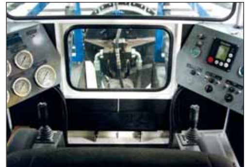
All Versi-Dredge® models come standard with joystick controls and oversized gauges for ease of operation.